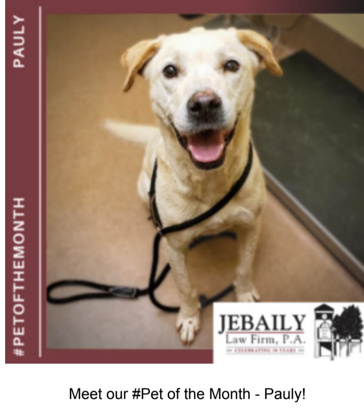
Meet our #Pet of the Month - Pauly!

Pauly is a 3-year-old mixed breed. He knows basic commands like sit, stay, down. He is abundantly friendly with humans, but he can be selective with other four-legged friends. He needs time to get to know other animals slowly. If you'd like to give Pauly a chance in your forever home, visit Petfinder to learn more!